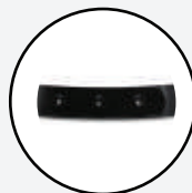
Quick-Adjusting Head Straps with Robust Elastic Webbing.