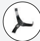
Adjustable 3-Position Head Support