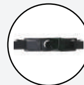
Quick-Adjusting Lower Head Strap Buckle & Clip